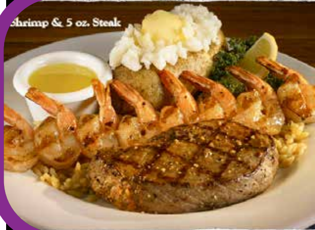
Shrimp & 5 oz. Steak

All Ponderosa Steakhouses have a rustic ambiance that is quaint and comfortable to reflect the home style cuisine that they serve. It’s the perfect place for families to relax and dine in a clean and cozy atmosphere. They bring the feeling of the Old West to all of their restaurant locations to create a real traditional American dining experience for all guests.